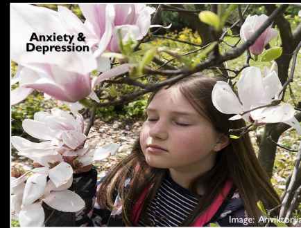
Anxiety & Depression